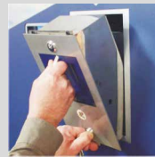
Removable loading drawer